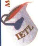
INDU ENGINEERING & TEXTILES LTD SHAREHOLDING PATTERN AS ON 30/09/2018 Table - III Statement showing shareholding pattern of the Public shareholding